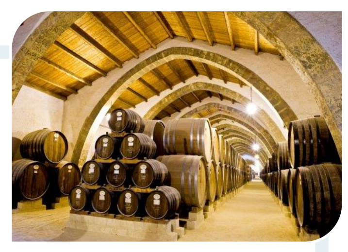
DAY 3 - 8th June - Saturday