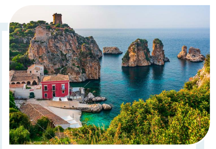
DAY 1 - 6th June - Thursday