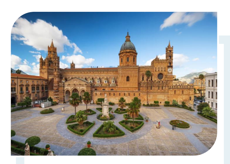
DAY 4 - 9th June - Sunday