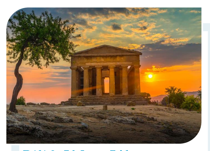
DAY 2 - 7th June - Friday

Friday morning yoga or fitness class 8-9 am Breakfast 9:15 am 3 Hours Work Shop 10 am -1 pm on self leadership by Annelise Mediterrenean Lunch Afternoon Experience SEGESTA Archaelogical Park Dinner and back to the Villa